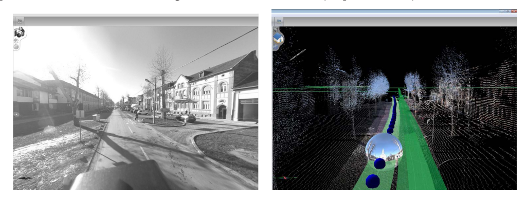
Figure 4: Spatial Factory<sup>®</sup> - digital image and trajectory from point clouds.

Apart from the system and server software, software support in the project's realisation was provided with the use of several tools for preparing spatial data and creating a specialised GIS for traffic signalisation. Data extraction from MMS products was performed using Spatial Factory software. Spatial Factory <sup>*</sup> is an application that enables the manipulation of point clouds obtained by laser scanning in motion. The advantage is observed in the possibility to present the integrated imagery material from digital cameras and laser scanners, simplifying the process of measuring and mapping detailed points (Fig. 4). The programme provides the possibility to map dots, lines and polygons. It is additional possible to form a spatial database or load the existing databases in order to survey, update or analyse data.