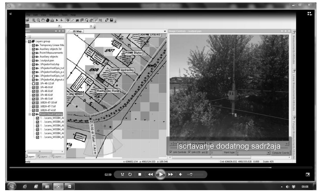
Figure 2: Possibility to insert additional content (aerial masts, trees etc.).

Miroslav Kuburić, Miloš Kopić, Bojan Matić | SODOBNE METODE PROSTORSKEGA PRIDOBIVANJA PODATKOV – POT K VZPOSTAVITVI E-UPRAVE | CONTEMPORA-RY METHODS OF SPATIAL DATA ACQUISITION – THE ROAD TO "E-GOVERNMENT" | 314 - 326 |