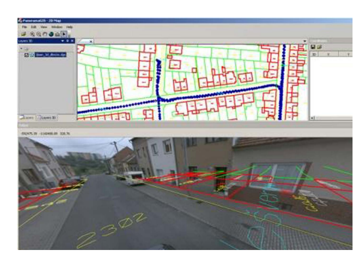
Figure 5: PanoramaGIS<sup>®</sup>- integration with the digital geodetic plan