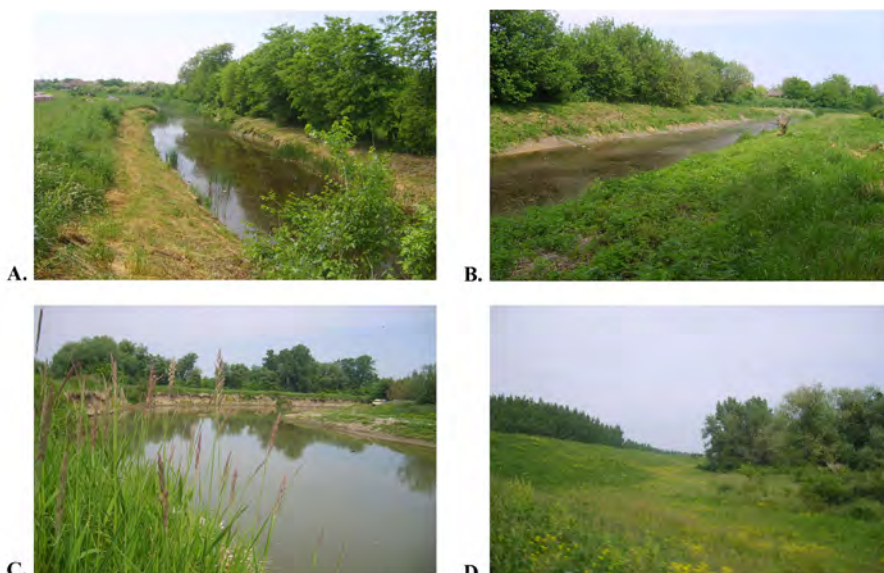
Figure 2: The researched spatial units: A. The west part of the branch (the first spatial unit), B. The east part of the branch (the second spatial unit), C. The third spatial unit, D. The earth embankment (Photo: Ivana Blagojević, May, 2011)