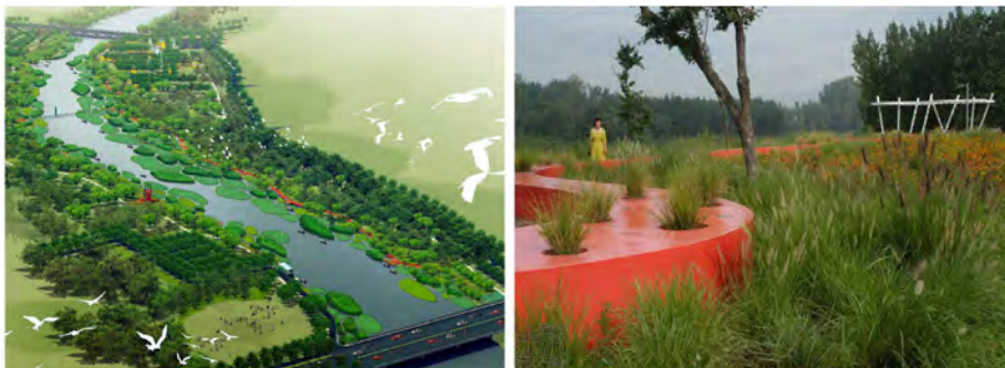
Figure 5: Park Qinhuangdao on the bank of the River Tanghe in China.

To minimize the existing dangers and to increase the safety, the periphery of the river bank should be fenced. Fencing can be achieved with simple rustic fence which will not disturb the existing atmosphere and will maintain its functionality. Fence can be laid out along the line of planted biological material. The use of shrubbery species is advised since the ground is made more compact due to their dense root development.