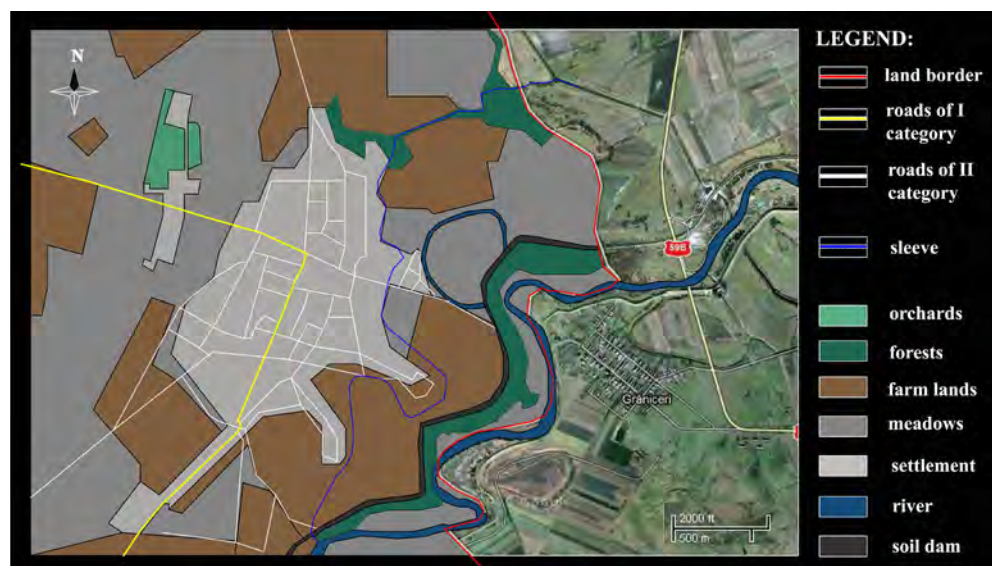
Figure 3: Map of the current state of the condition in the research area

Conducted checklist of the landscape vegetation (Table 2), showed the dominance of deciduous species (poplar and willow). The place has monotonous and monochrome appearance. The composition of the vegetation is quite modest and is based on forming vegetative groups. When it comes to the form, organic type dominates with the mixture of woods and meadows. The levels of the vegetation are not very prominent in any of the researched units.